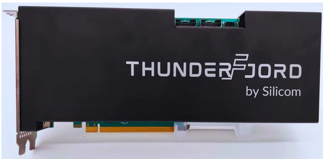
ThunderFjord by Silicom.