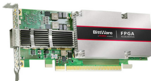
IA-420F by BittWare.